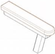
D - Bench Arm