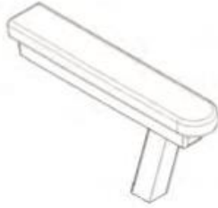
D - Bench Arm