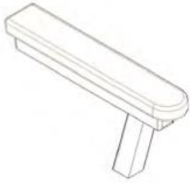
D - Bench Arm