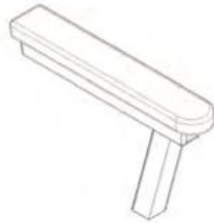
D - Bench Arm