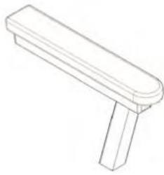
D - Bench Arm